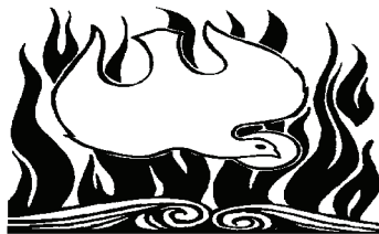
The Spirit of the Lord fills the world

COLUMBUS HOUSE YOUNG PARENT SUPPORT PROGRAM BABY BOTTLE FUNDRAISER: Please return bottles the weekend of June 17 th /18 th . Money collected will be used for programs offered through Young Parent Support Program, which supports young families ages 15 - 25 and their children 0 - 6 years.